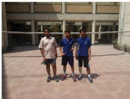
WINNER - PATEL HOUSE